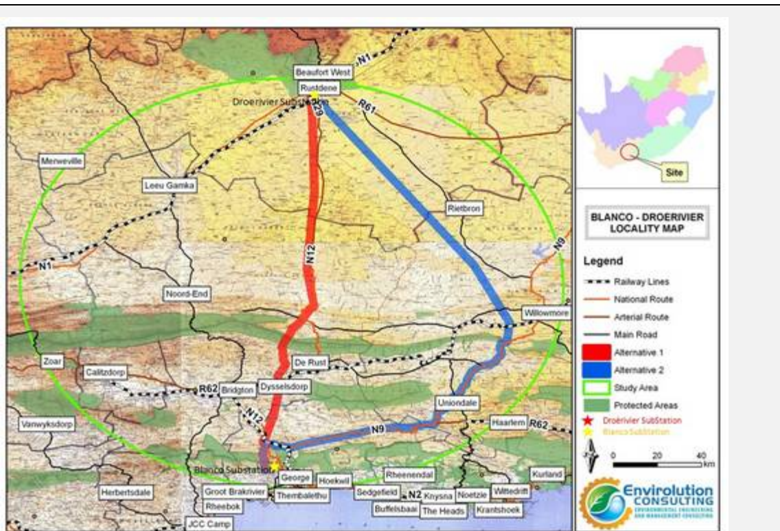
Figure 1: Locality map for the proposed Blanco-Droërvier 400kV Power line and Substations upgrade.

NB: A separate application will be submitted for the construction of the 400kV Transmission power line from the Gourikwa Substation at Mossel Bay to the Blanco (Narina) Substation at George, and that impact assessment will be presented in a separate report.